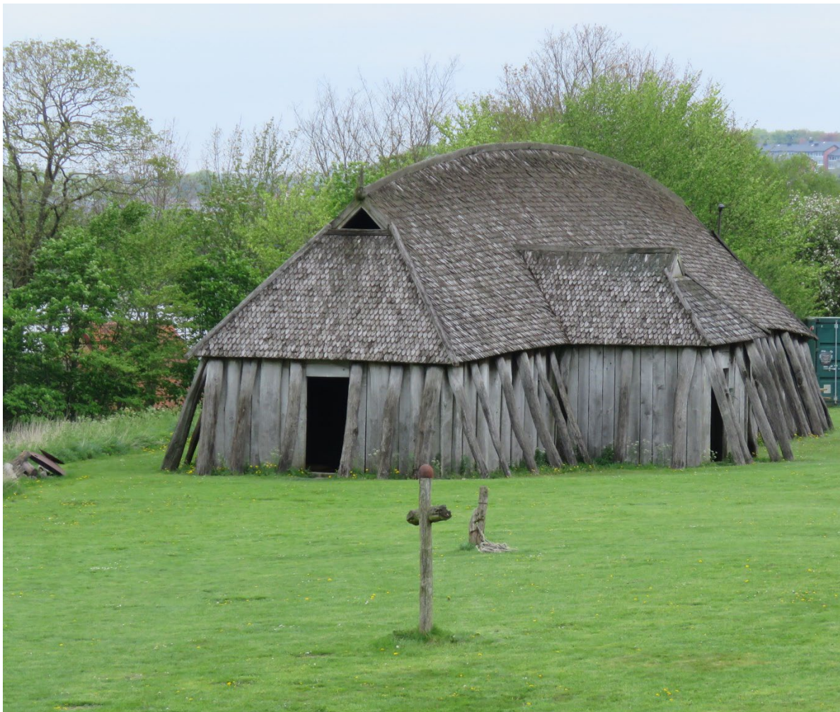
Recreated Viking Longhouse, adjacent to the Fyrkat Viking Ring Castle, Denmark Photo by Donna Herum (Kirsten Thorsteinsdottir)

~ September - October ~ Anno Societatis LIX (2024) Issue #137